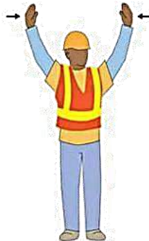
Distance left to back