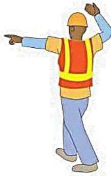
Back, turn left