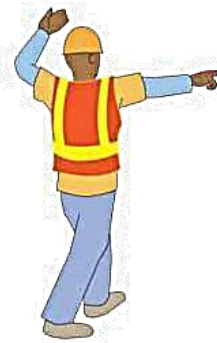
Back, turn right